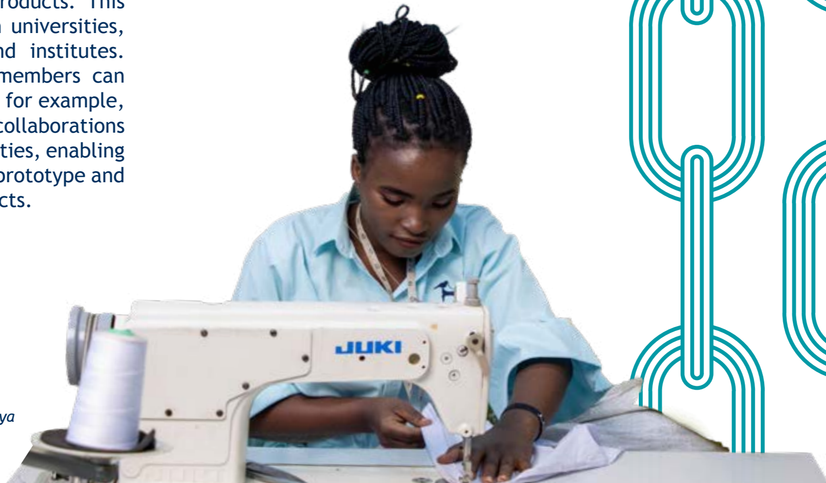
Seamstress Pistis Threads & Stitches Supported by YBI Member: Sinapis, Kenya

Social and green entrepreneurship remains a relatively nascent area of youth entrepreneurship. Building awareness is critical to realising its potential. This could include conferences, awareness events, learning initiatives, networking, hackathons and competitions. These events can help to socialise the meaning and importance of social and green entrepreneurship. They can educate and inspire a more vibrant and inclusive ecosystem.