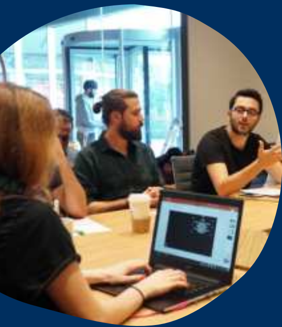
YHabitat Derneği's team, YBI member, Turkey

YBI builds relationships with and secures funding from like-minded organisations who recognize the role of youth entrepreneurship as a force for good