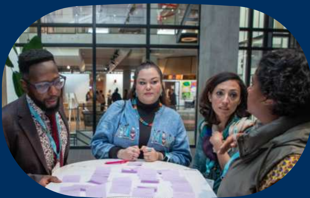
YBI members at YBI's Global Youth Entrepreneurship Summit, The Hague, 2022

Through collaborative tools, we have learnt about the current state of and different perspectives on entrepreneurship and sustainability in different countries. We are very excited to be able to pilot this sustainability toolkit with our young entrepreneurs.