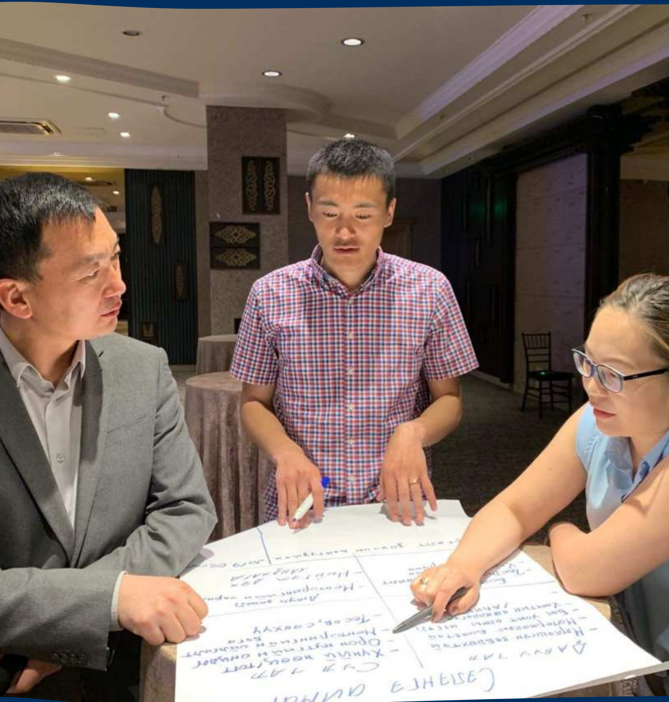
Development Solutions' team, YBI member, Mongolia