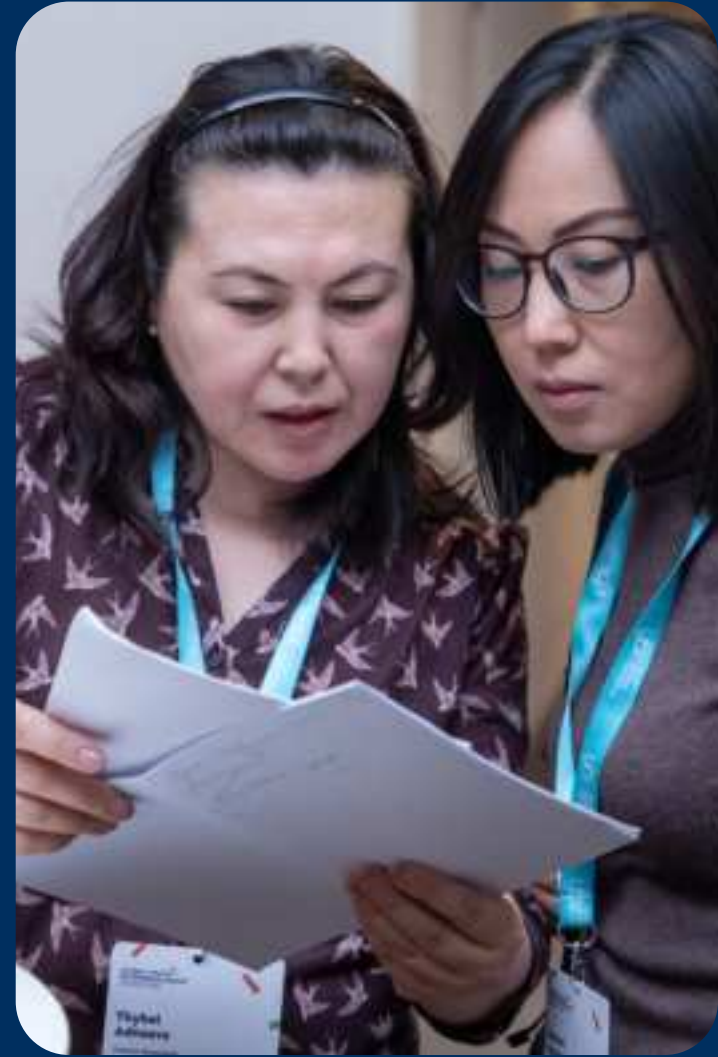
YBI members participating in different YBI events and trainings