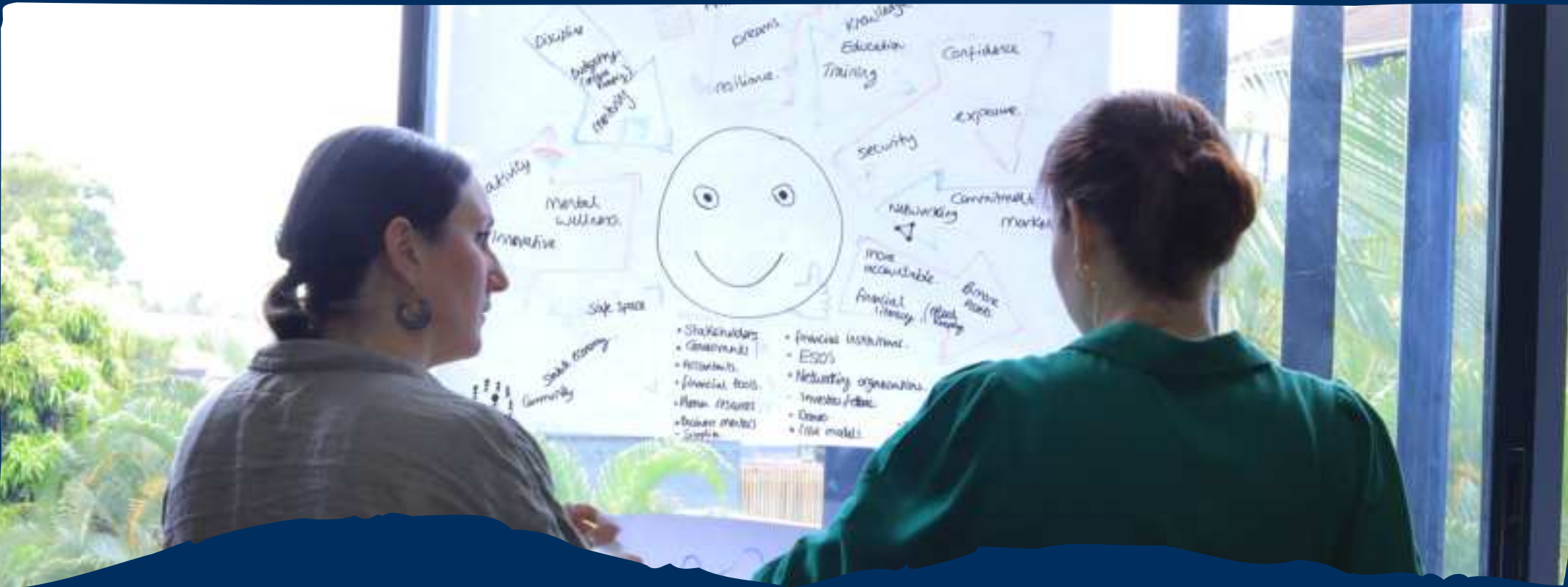
YBI facilitators at YBI's Community of Practice, Kampala, 2023

Some of the usable solutions our unique collaboration approach has focused on: