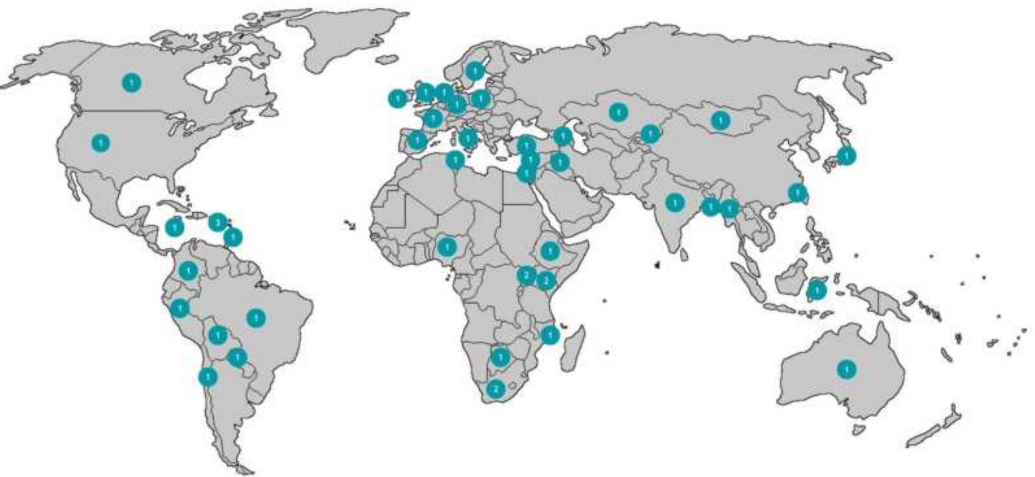
YBI Global Network map

YBI has launched an ambitious strategy aiming to create one million jobs by 2025. We can only achieve that level of impact by working with others.