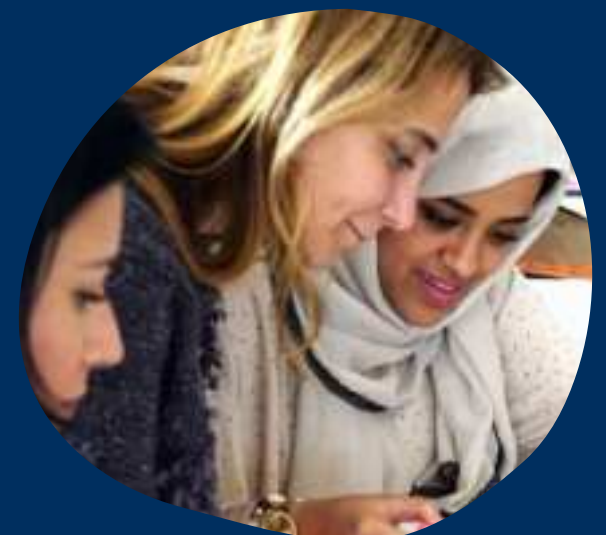
YBI members participating in different YBI events and trainings