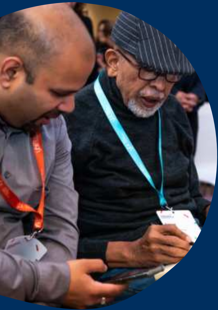
YBI members networking

“ it doesn't matter if you're from Botswana or from England or from Poland, It's all connected. YBI is connection ”