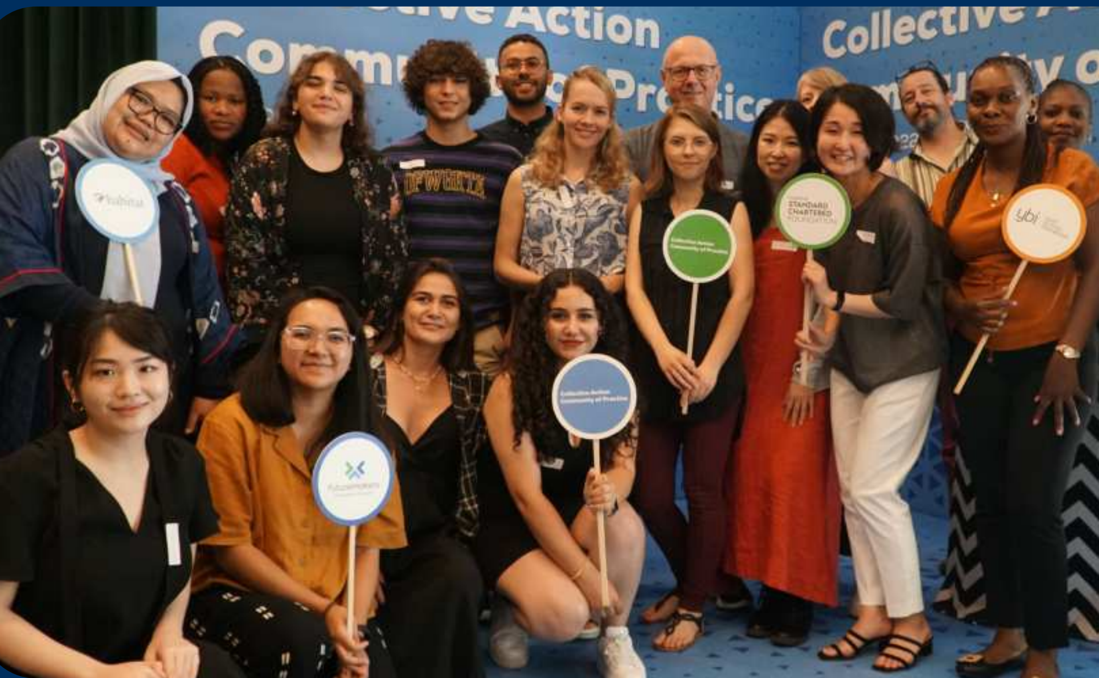
Group of YBI members at YBI's Community of Practice event, Turkey 2022

Established in 2000, our leadership of the only global youth entrepreneurship network gives us a unique perspective on youth entrepreneurship worldwide, and the ability to bring together our members from across the globe to connect, collaborate and exchange ideas, knowledge and insights.