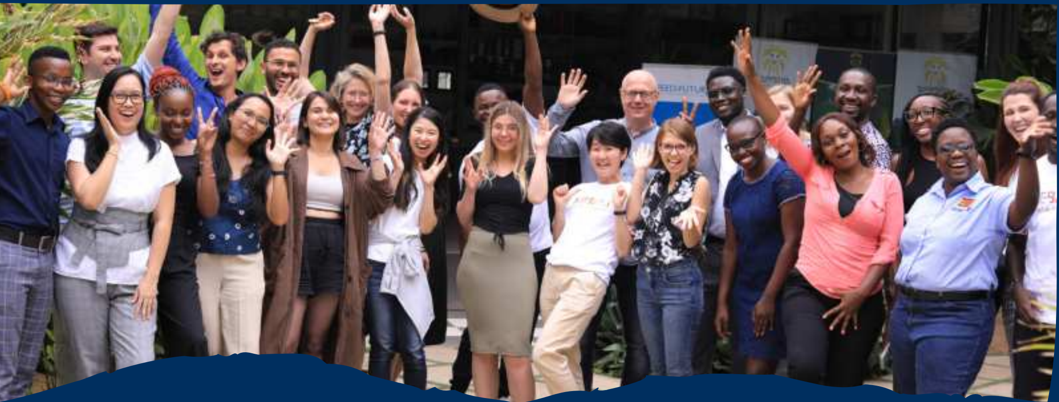
Group of YBI members at YBI's Community of Practice event, Kampala, 2023

We focus on building trusted relationships and enabling deeper connections, we understand that engagement and commitment follow when a trusting and open environment is provided.